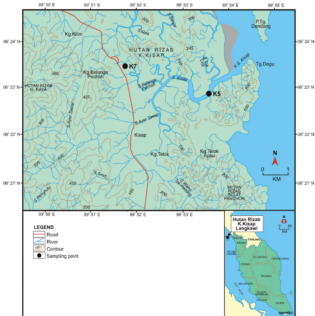
FIGURE 1. Map of Langkawi Island showing the study sites at Kisap Forest Reserve, Langkawi Island, Peninsular Malaysia